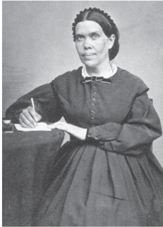
Ellen G. White was one of the founders of the Seventh-day Adventist Church.