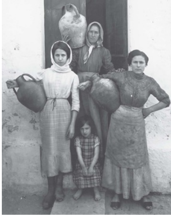
Photographed almost a century ago, this child and three Sardinian women dressed in traditional garb gather outside a doorway in 1913.