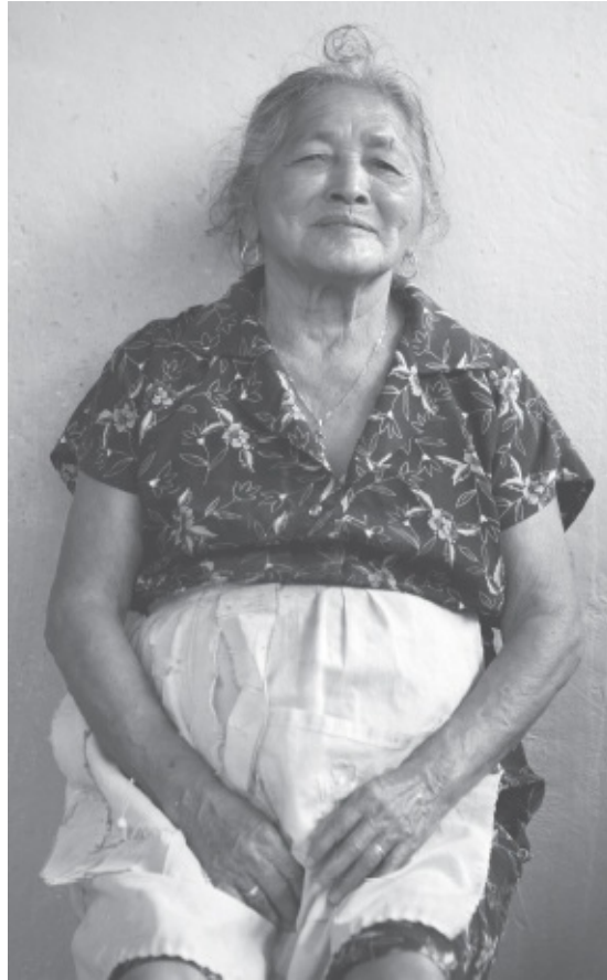
This Nicoyan woman bakes tortillas and walks five miles to the village to sell them.

The next day, following a map the policeman had drawn, we drove up a steep, rutted road that snaked into the forested hills along the peninsula's spine. At a roadside shack we parked and got out. Three little kids stared at us as we started walking along a footpath that led into the bush.