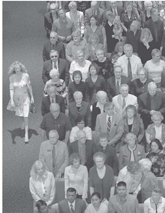
Seventh-day Adventists worship at the University Church in Loma Linda, California.

Belonging to a religious community can foster larger and denser social networks. People who attend services may have higher self-esteem and self worth because religion encourages positive expectations, which in turn can actually improve health. When individuals undertake and successfully act in ways prescribed by their roles, their self-concept and sense of well-being are reinforced. To a certain extent, adherence to a religion allows them to relinquish the stresses of everyday life to a higher power. A code of behavior is clearly laid out before them. If you follow it, you have the peace of mind that you're engaging in "right living." If today goes well, perhaps you deserve it. If today goes poorly, it's out of your hands.